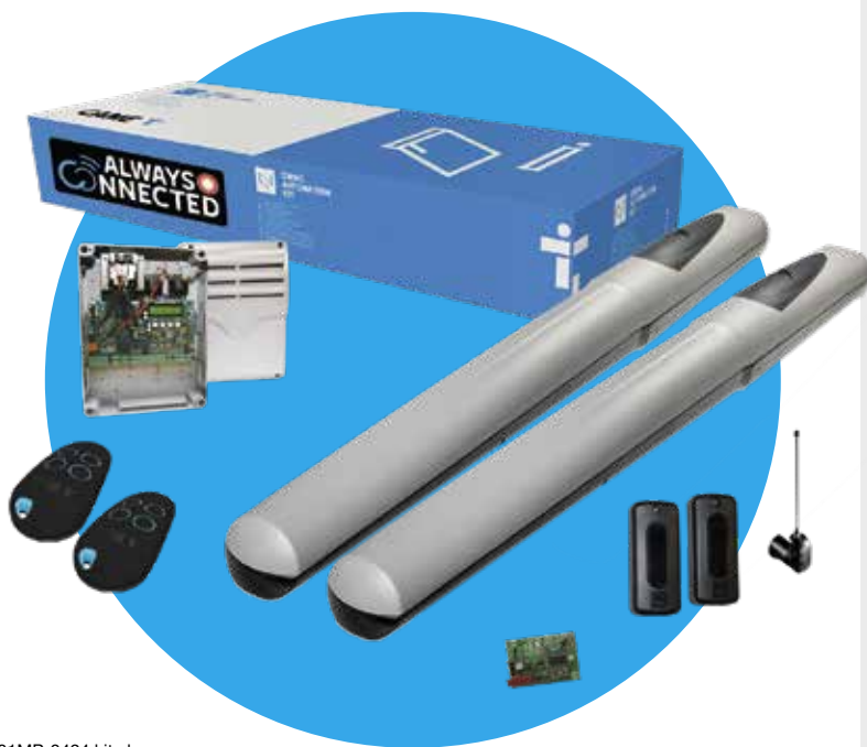
8K01MP-0424 kit shown.